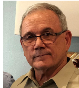
De Ron Jones Club Championship